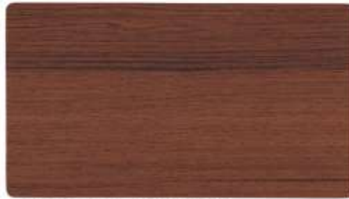
HPL-213 ROYAL TEAK