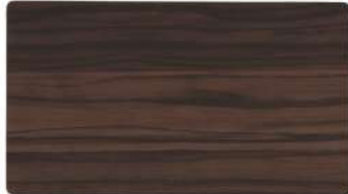
HPL-202 CHOCOLATE ZEBRANO