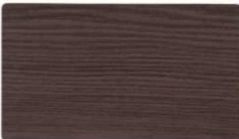
HPL-214 SATIN WOOD