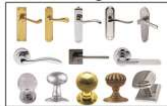
Door Handles and-Knobs