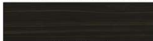
ALV-101 (Wenge) "The sophistication of timber"