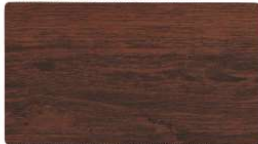
HPL-206 AFRICAN WALNUT