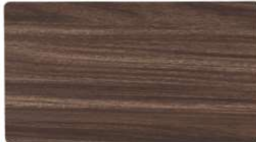
HPL-211 WINTRY ASH