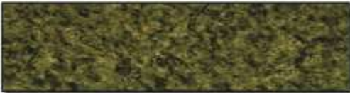
ALV-106-(Granville) "The grandeur of nature"