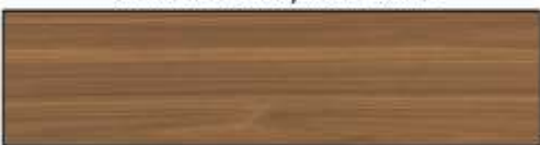
ALV-102 (Oakwood) "The splendor of oak"