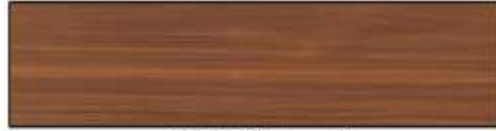
ALV-112-(Tineo) "The intricacy that enchants"