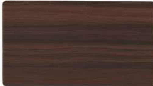
HPL-208 DARK OAK