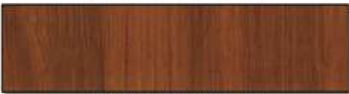
ALV-116 (Royal Teak) "Unusual Properties of being and excellent New"