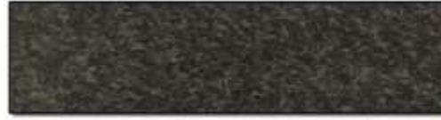
ALV-109-(Venziano-Granite) "The Intensity that captivates"