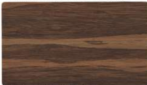
HPL-205 ZEBRA WOOD