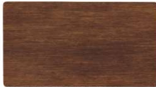
HPL-204 CLASSIC WALNUT