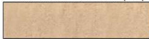
ALV-119 (Periato) "Known the world over for their excellent quality" New