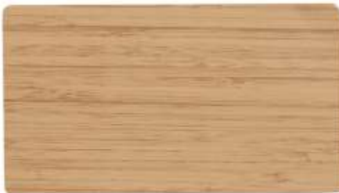
HPL-210 FUSION WALNUT