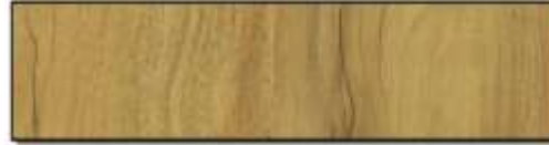
ALV-110 (Burn Walnut) "The versatility of walnut"