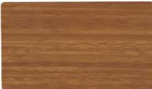
HPL-212 NAYANA TEAK