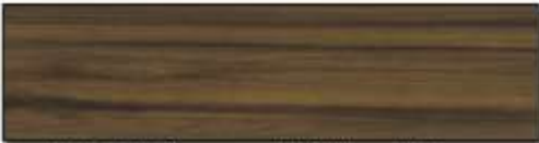
ALV-111 (Louropreto) "The richness of the Amazone forest"