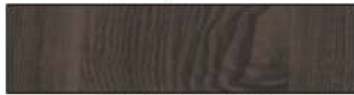
ALV-117 (Satin wood) "Colour with a reflective sheen" (New)