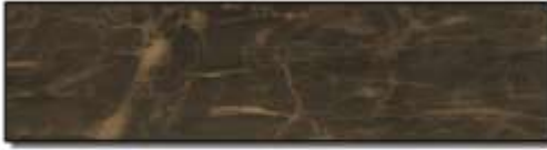
ALV-105 (Emperador) "The Style that rules"