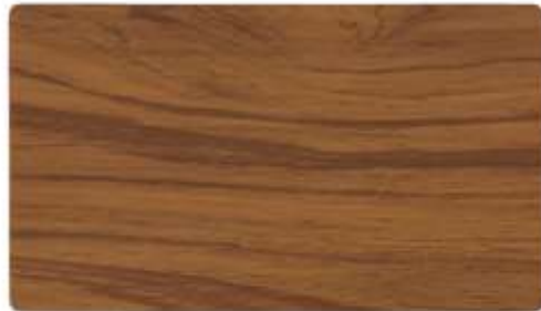
HPL-203 AMERICAN WALNUT