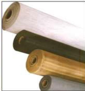
Aluminium Fly Mesh