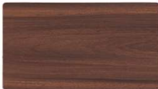
HPL-215 DARK TEAK