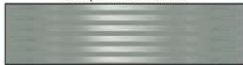
ALV-113 (Silver Line) "Comfort in a gloomy situation" New