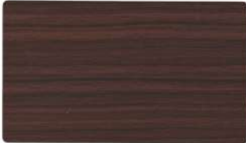
HPL-207 BROWN DUGLAS