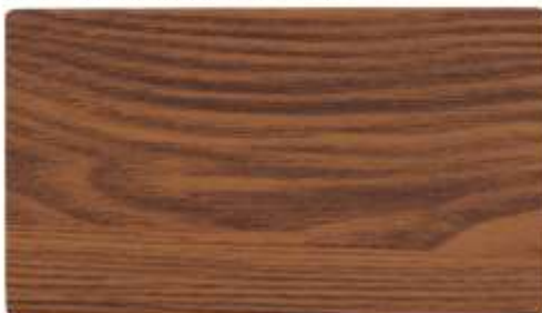
HPL-209 FUSION WALNUT